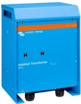
Isolation Transformer 3600W