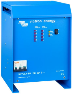
Skylla TG 24 50 3 phase

In order to compensate for voltage loss due to cable resistance, TG chargers are provided with a voltage sense facility so that the battery always receives the correct charge voltage.