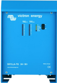
Skylla TG 24 50