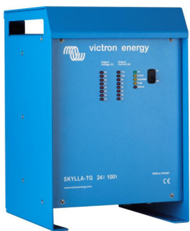
Skylla TG 24 100